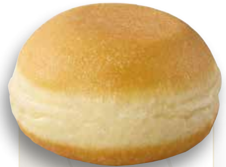
Berliner with filling, plain