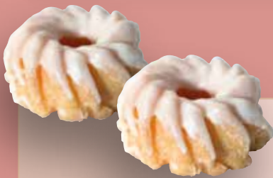
Mini Cruller with light glaze