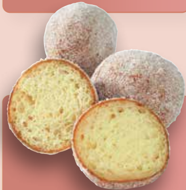
Mini curd cheese balls with sugar