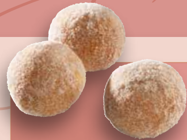
Mini buttermilk balls with sugar