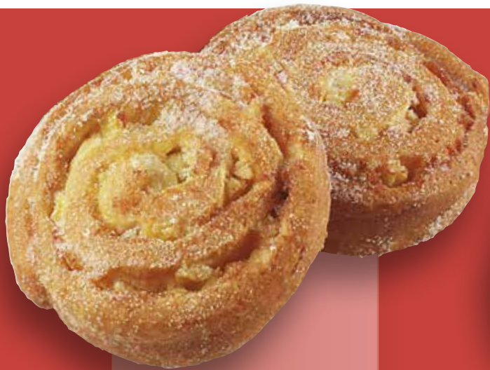
Apple Swirls with fresh apples powdered with sugar