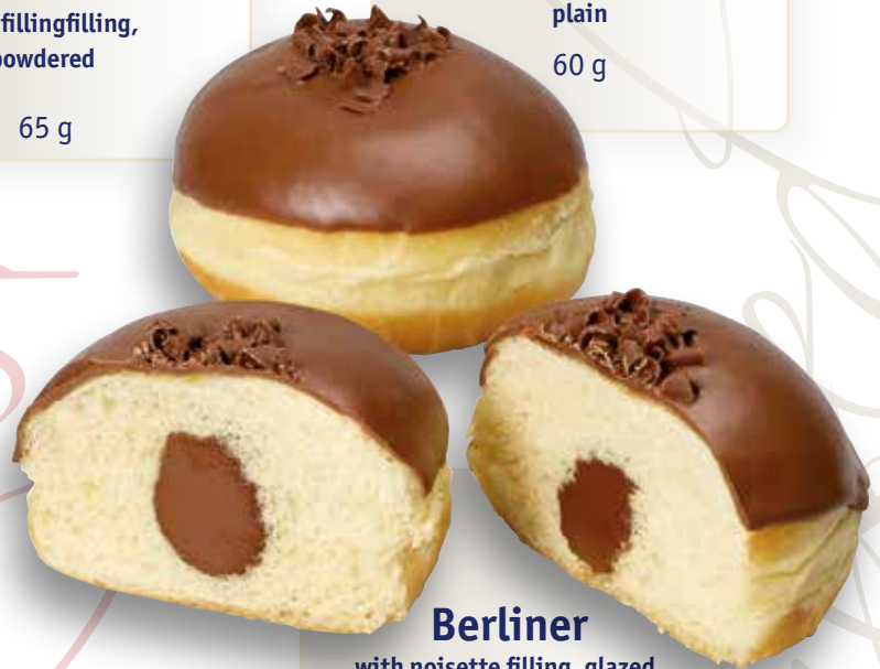
Berliner with noisette filling, glazed, decorated with chocolate curls