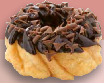
Cruller with cocoa fat glaze and chocolate chips