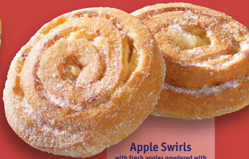
Apple Swirls with fresh apples powdered with cinnamon and sugar