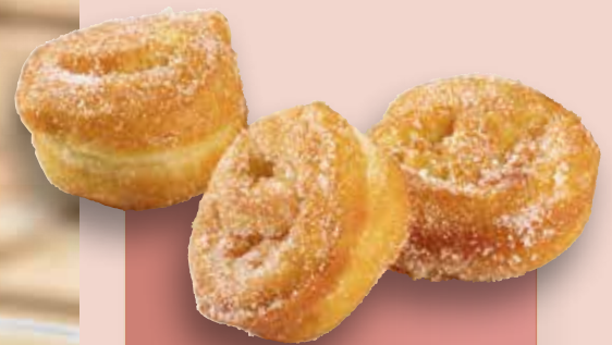
Mini Apple Swirls with apple pieces, decorated with sugar