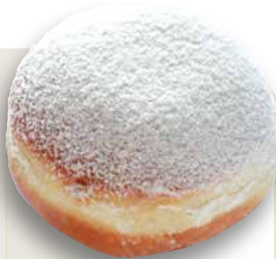
Berliner with filling, filling, powdered