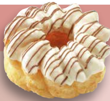
„Zebra“ Cruller with light glaze and stripes of cocoa fat glaze